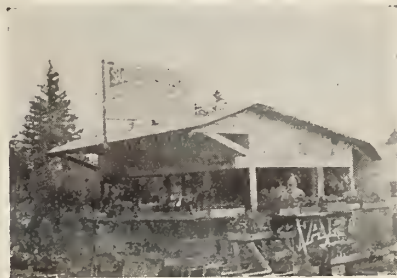
Where it all started